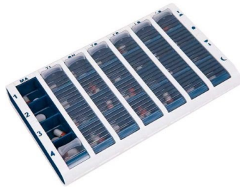
Large, blue Art.No. 120050