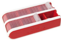
Small, red Art.No. 120045