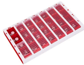
Large, red Art.No. 120055

Schine Pill Box is a storage box for medicins. The box is classified as a Med-tech product Class I.